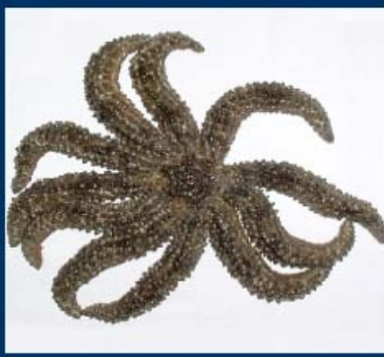
Cushion seastar ( Patriella calcar )